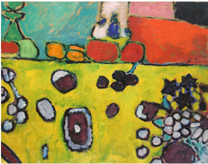
Nature morte sur nappe colorée Alexey von Jawlensky, 1909