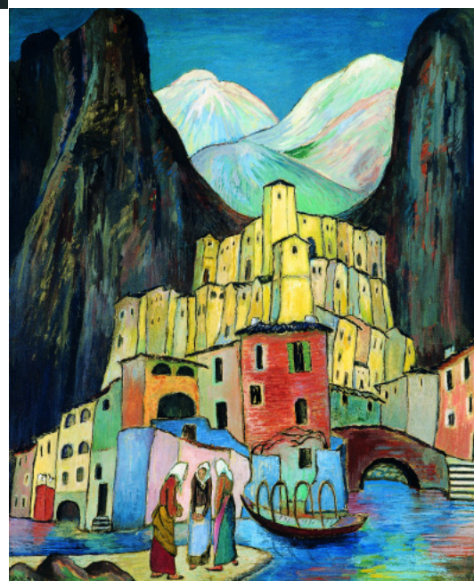
La città dolente. Marianne von Werefkin, 1930

In collaboration with the Centre d'État des musées et des expositions ROSIZO and the Russian Ministry of Culture