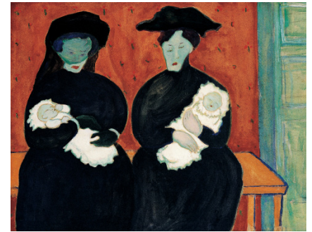
Les Jumeaux. Marianne von Verefkin, 1907