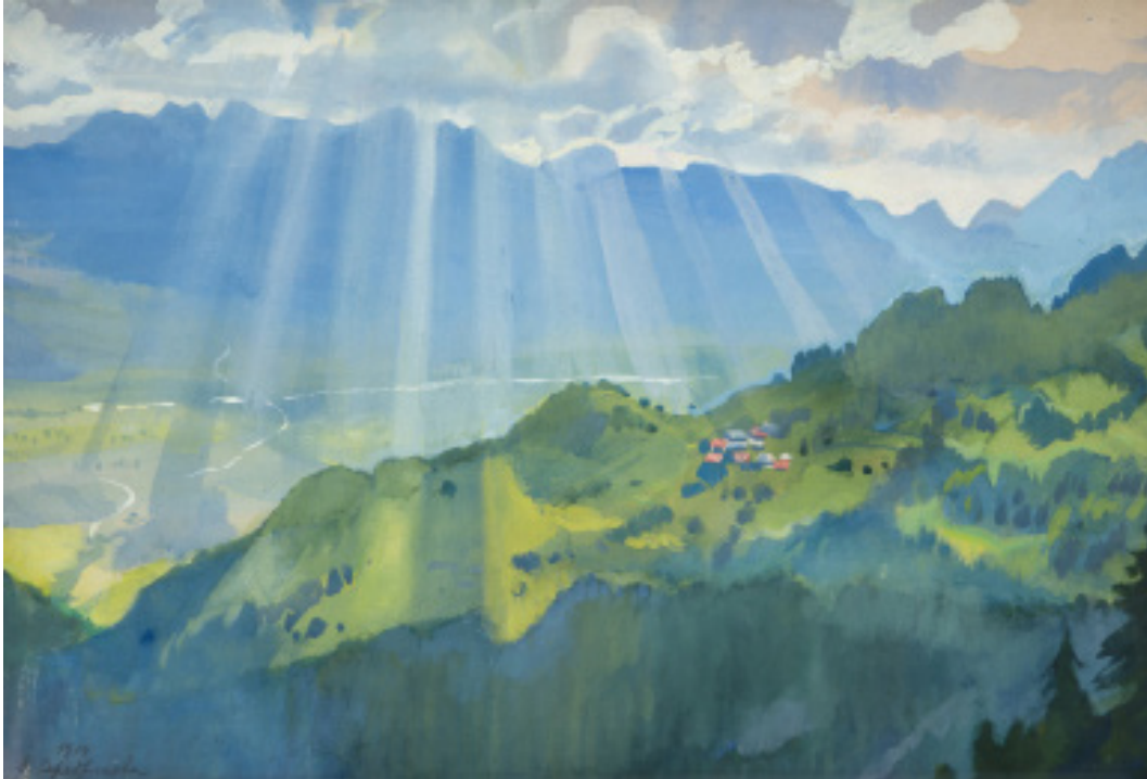
Rayons de soleil sur paysage de montagne. Zinaïda Serebriakova, 1914 © Musée Russe, Saint-Pétersbourg